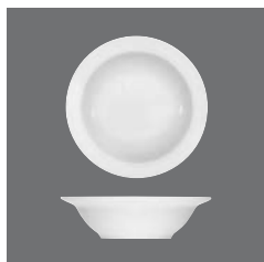
Salatiere rund , Salad dish round, Saladier rond, Ensaladera redonda, Insalatiera rotonda