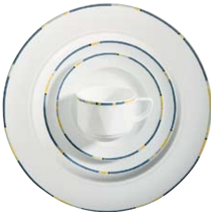
409500 Combo Blau