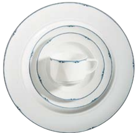
409520 Piccolo Blau