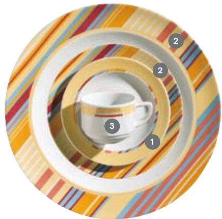
1 418280 Toccata Fond 2 418290 Toccata Strifen 3 418300 Toccata