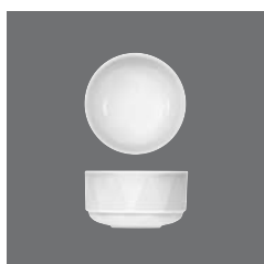
Bowl rund , Bowl round, Bol rond, Bowl redondo, Coppetta rotonda