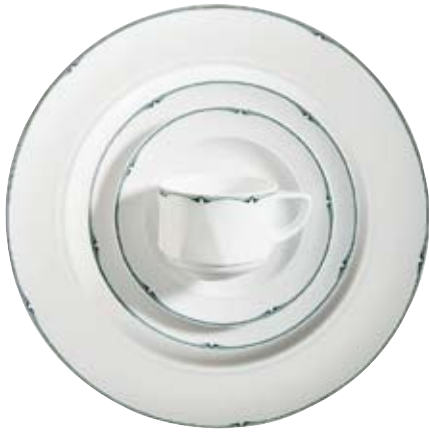
409230 Piccola Lagerdekor, Stock decoration, Décoration de stock, Decorado de stock, Decoro su articoli in magazzino