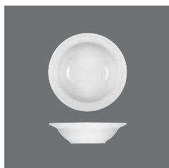
Kompottschale rund , Fruit saucer round, Compotier rond, Compotera redonda, Coppetta rotonda