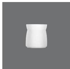
Konfitürentopf , Jam dish, Bol à confiture, Mermeladera, Vaso marmellata