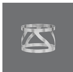
Präsentationselemente, Edelstahl , Elements for presentation, high grade steel, Éléments pour présentation, acier spécial, Base metálica para presentación, Elementi di presentazione acciaio