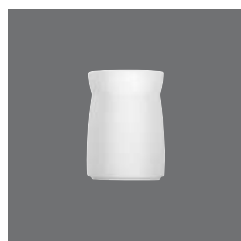
Dressingtopf , Dressing pot, Pot à sauce froide, Recipiente salsa fría, Vaso dressing