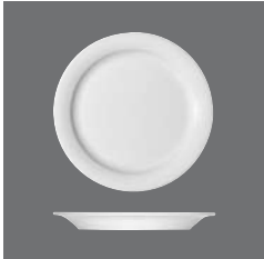
Teller flach Fahne , Plate flat with rim, Assiette plate avec l'aile, Plato llano con ala, Piatto piano