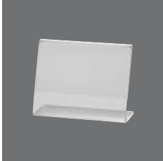
Acryl Aufsteller , Acrylic display, Support en acryl, Display acrilico, Espositore in materiale acrilico