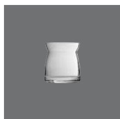
Konfitürentopf Glas , Jam dish glass, Bol à confiture en verre, Mermeladera de cristal, Vaso marmellata in vetro