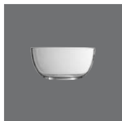
Schüssel Glas transparent , Salad dish glass lucent, Saladier en verre transparent, Ensaladera de cristal transparente, Insalatiera in vetro trasparente