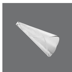
Füllhorn Glas , Horn of plenty glass, Corno d'abondance en verre, Cuerno de abundancia de cristal, Cornucopia in vetro