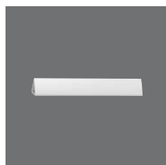
Präsentationselement, Kunststoff , Element for presentation, plastic, Élément pour présentation, plastique, Elemento plástico para presentación, Elemento di presentazione in plastica