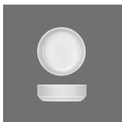
Kompottschale rund, Fruit saucer round, Compotier rond, Compotera redonda, Coppetta rotonda