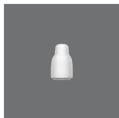
Pfefferstreuer, Pepper shaker, Poivrière, Pimentero, Spargi pepe

> Salzstreuer 25 4011 2528 - 53 (2.09) 89 105