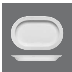
Platte oval halbtief Fahne, Platter oval half-deep with rim, Plat ovale demi-creux à l'aile, Fuente oval con ala, Piatto ovale semifondo