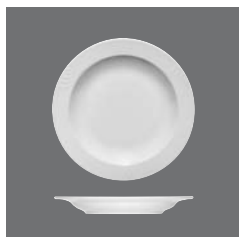
Teller halbtief Fahne, Plate half-deep with rim, Assiette demi-creuse à l'aile, Plato medio hondo con ala, Piatto semifondo