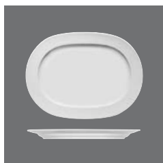
Platte oval Fahne, Platter oval with rim, Plat ovale à l'aile, Fuente oval con ala, Piatto ovale