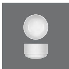
Bowl rund, Bowl round, Bol rond, Bowl redondo, Coppetta rotonda

> Bowl rund 0.27 25 6510 2558/0.27 0,27 (9.13) 95 (3.74) 56 / 456 195