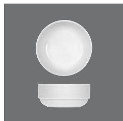
Suppenschale, Bowl, Bol, Bowl, Coppetta

> Bowl rund 0.27 25 6510 2558/0.27 0,27 (9.13) 95 (3.74) 56 / 456 195