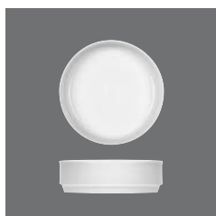
Eintopfschale, Stew bowl, Bol à plat unique, Ensaladera redonda, Insalatiera rotonda