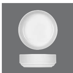
Salatiere rund, Salad dish round, Saladier rond, Ensaladera redonda, Insalatiera rotonda